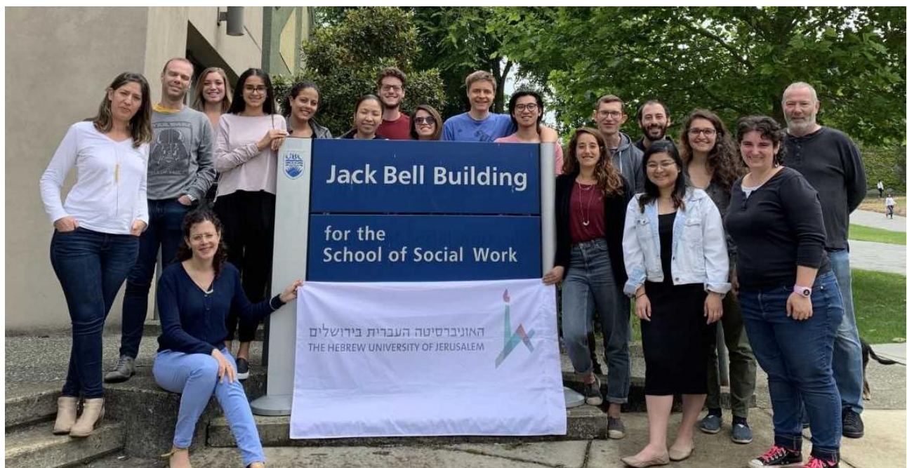
HEBREW UNIVERSITY OF JERUSALEM & UBC SCHOOL OF SOCIAL WORK VANCOUVER