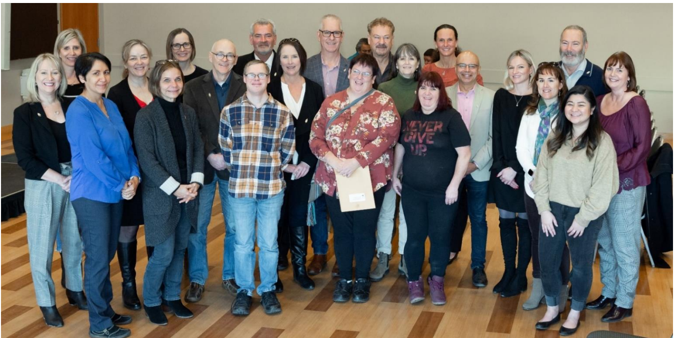
NATIONAL RESEARCH NETWORK INITIATIVE MEETING, UBCO