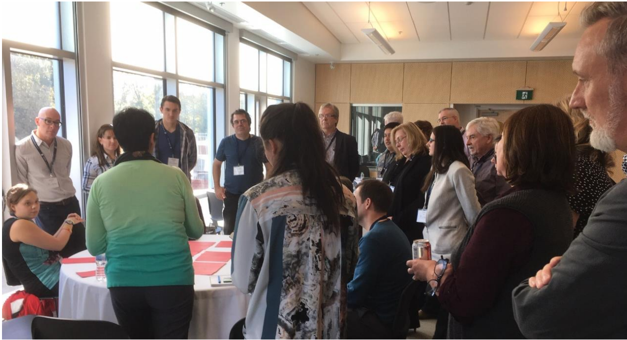
TYDE PROJECT PARTNER CONSULTATION

This project is an interdisciplinary, cross-sectoral network of partners committed to improving the employment outcomes for transitioning youth ages 14 – 18 with intellectual disabilities or autism in British Columbia through early an intervention targeting youth and their parents/caregivers. Through this partnership, we are creating an interactive online curriculum to increase employment outcomes for youth with developmental disabilities by increasing youth pre-employment skills, increasing youth self-determination, and improving parental/caregiver knowledge and expectations for fostering their youth's future employment experiences.