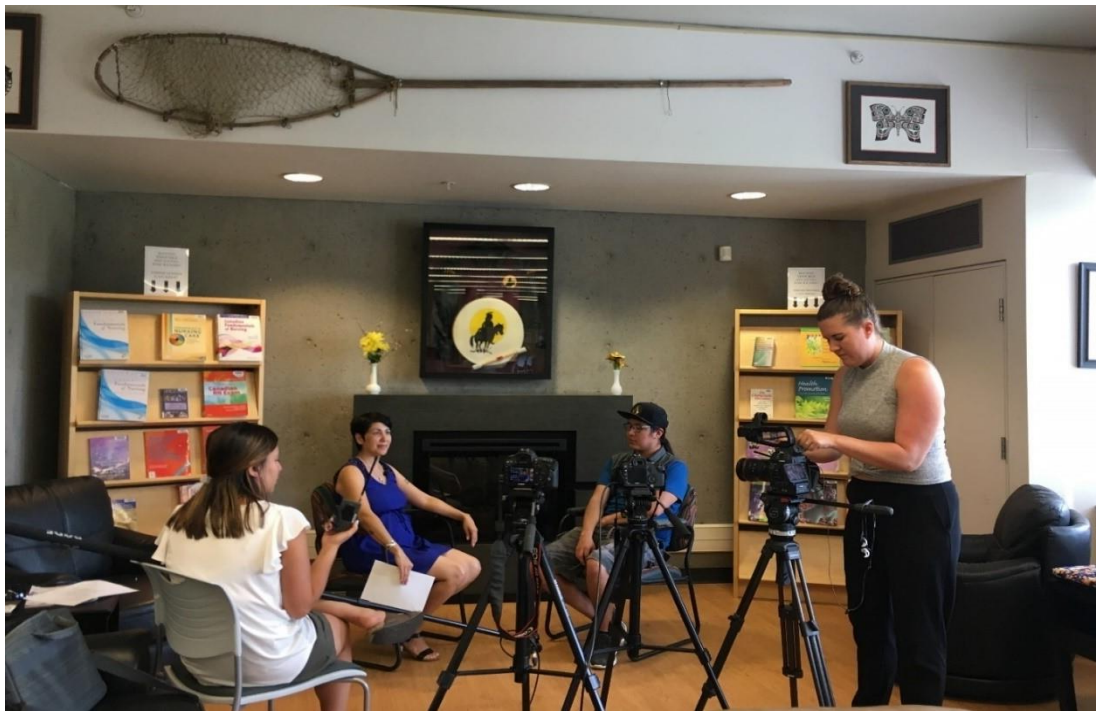
TYDE PROJECT VIDEO PRODUCTION