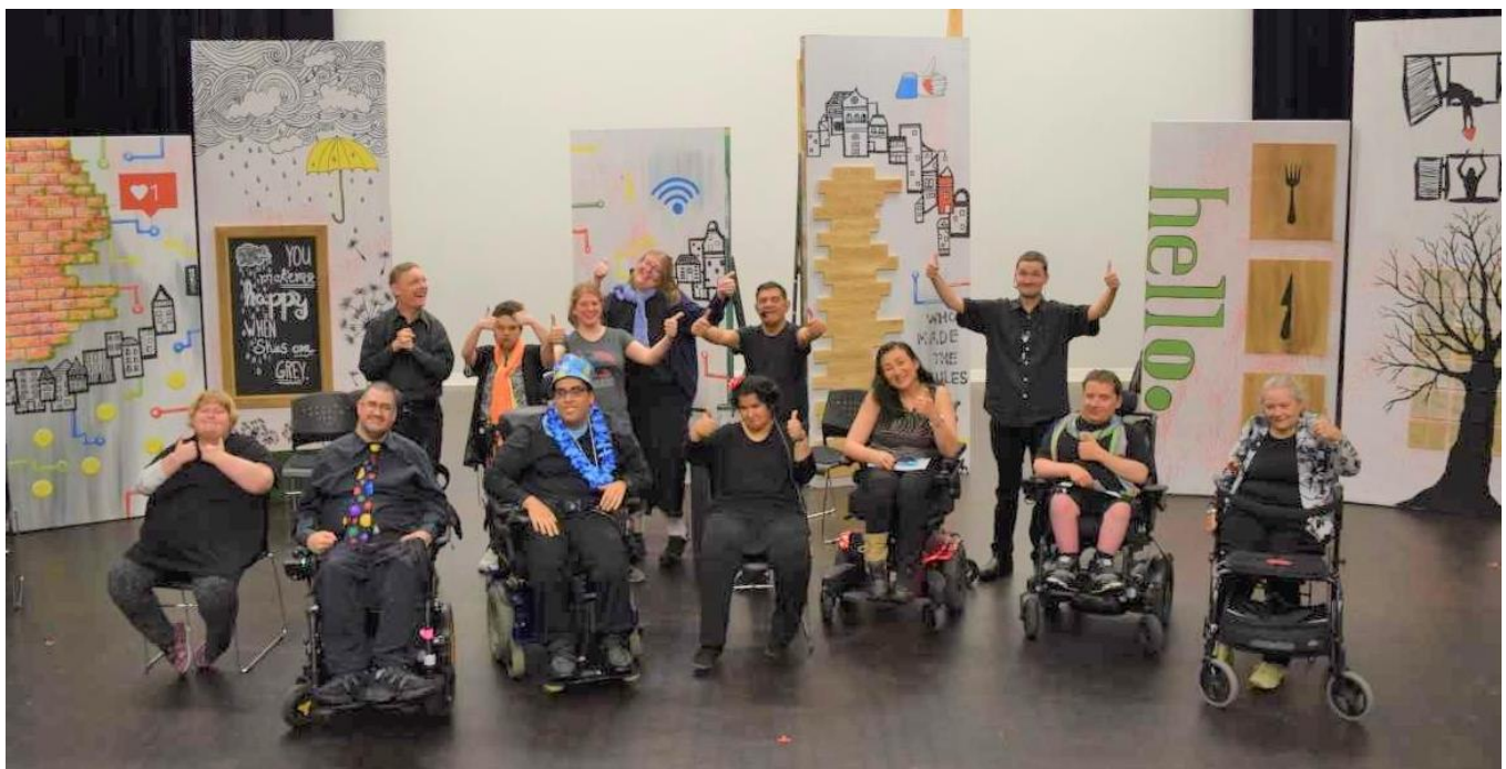
ROMANCE, RELATIONSHIPS & RIGHTS ACTORS/CO-CREATORS